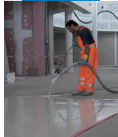
Mechanical application of Ultratop