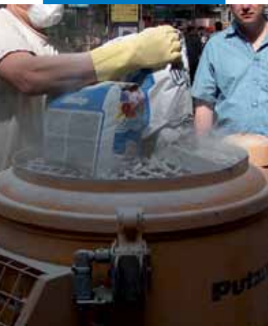
Preparation of Ultratop in a mixer