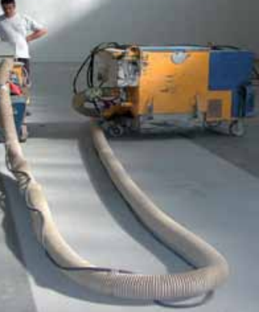
Preparation of the substrate by shot-blasting

Spread Ultratop by hand or with a mechanical means (rendering machine with a worm-screw feeder) in a single layer of 5 to 40 mm and a smoother for a natural finish, or at a thickness between 10 and 40 mm if the floor is to be polished. Make sure that the material is cast in a regular, continuous flow without interruptions, to avoid defects in flatness and particularly visible differences in colour. Thanks to its self-levelling properties, Ultratop eliminates all imperfections left by the smoother.