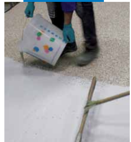
Application of Ultratop on the hardened surface of the mixture made of natural aggregates + Mapefloor 910