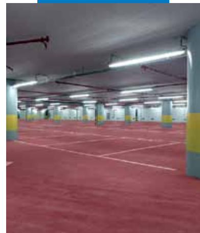
Floor made using red Ultratop in the Berlaymont Building, Brussels