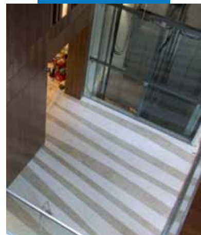
Hotel Design - Budapest - Hungary. "Terrazzo alla veneziana" effect Ultratop