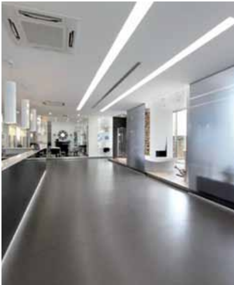
Show-Room Quartarella Altamura (BA) - Italy. "Natural effect" anthracite Ultratop

be grouted using Ultratop Stucco after the "roughing" cycle.