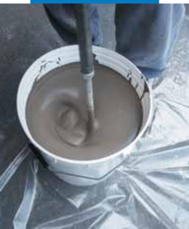
Preparation of the product with a drill