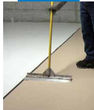
Smoothing Ultratop immediately after spreading