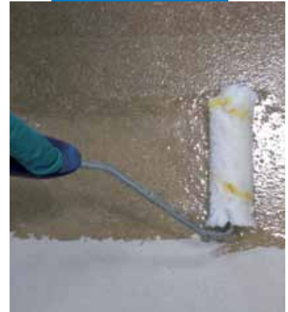
“Terrazzo alla veneziana” effect. Application of Mapefloor I 910