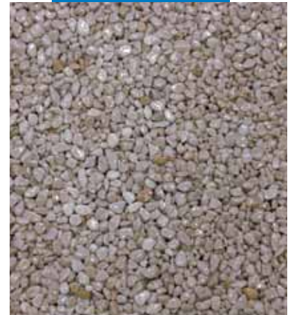
Application of the mixture of natural aggregates + Mapefloor I 910