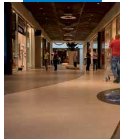
The final result of a floor made using Ultratop