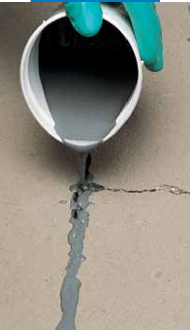
Repairing a crack in cement screed with Eporip