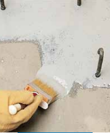
Applying Eporip by brush on construction joint