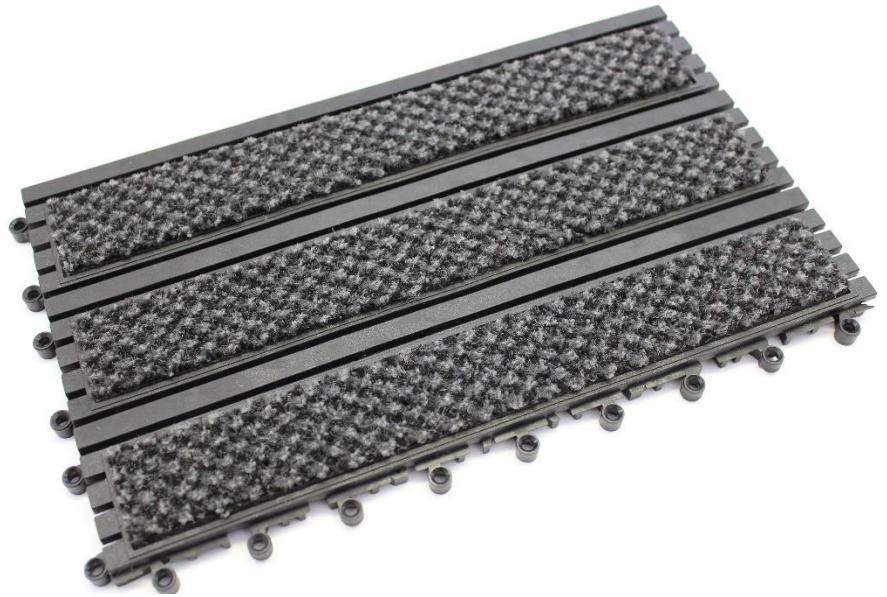
Black & Grey