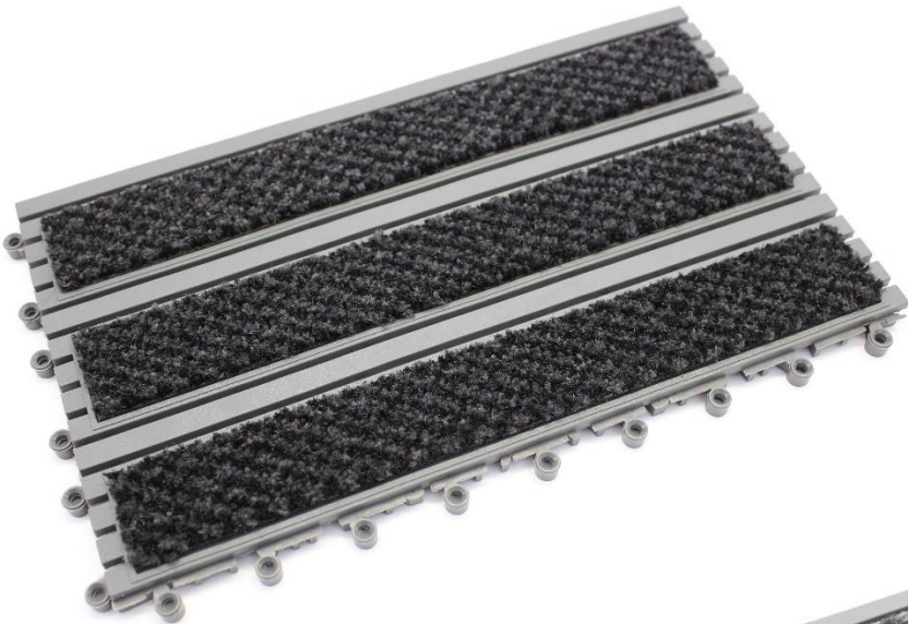
Grey & Black