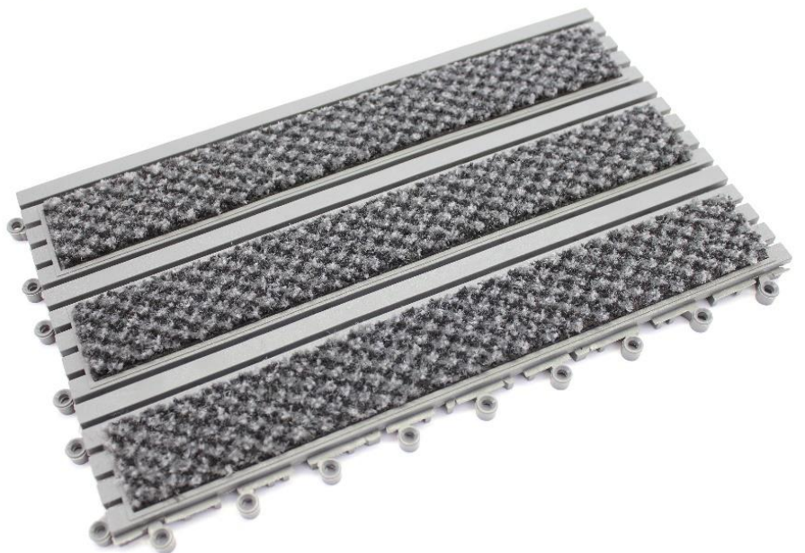
Grey & Grey