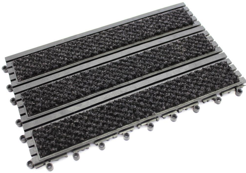
Black & Black