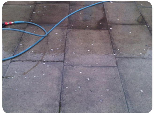
Pavement before treatment with Gum Stopper